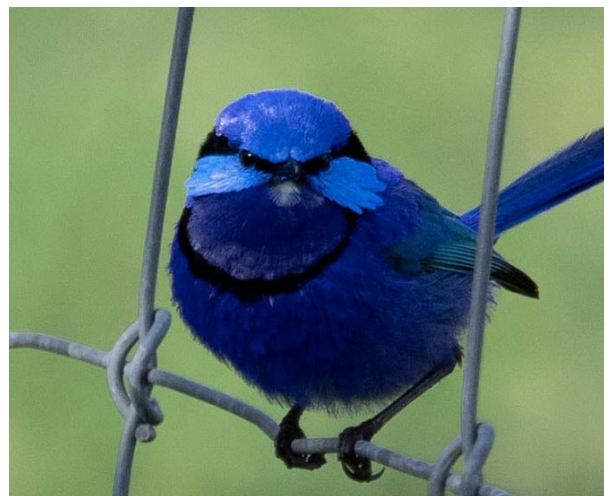
The vulnerable Red-tailed Cockatoo and a Blue Fairy Wren!

To upload your photo, go to the VRA website www.vinesra.com.au , select 'Record Wildlife Sightings', upload your photo and put 'photo competition' in the comment box.