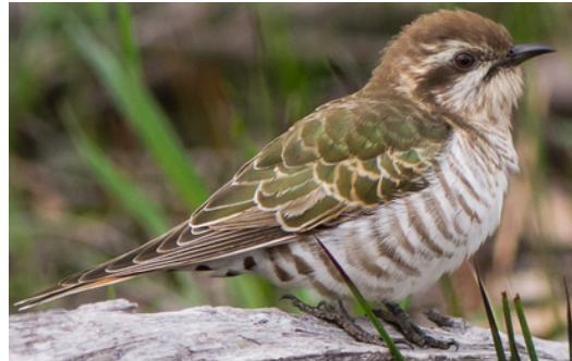
Horsfield's Shining Bronze