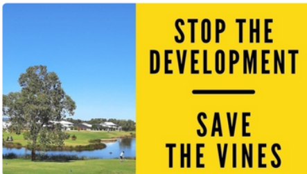
The Vines Residents & Ratepayers Association started this petition to Owners and Board of Directors of The Vines (WA) Pty Ltd

Thanks to all who have already voiced their opposition to the redevelopment by signing the petition. In addition to the number of households who are members of The VRRRA, the number of signatures to this online petition will be evidence of the size of the outcry against the proposed changes to the golf course.