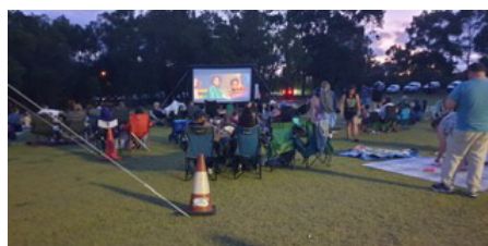
Family Movie: A Boy Called Christmas

It was wonderful to see families set up early to get a good spot in the shade in readiness for the family movie, and judging by the crowd the movie was well received with lots of positive feedback about the movie itself, location, viewing and sound quality given.