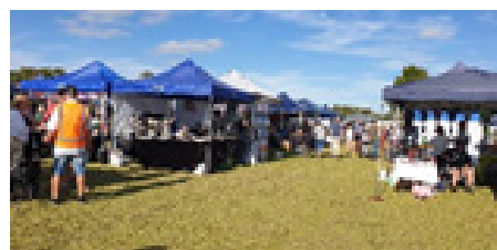
Stall Holders ready for the Crowd