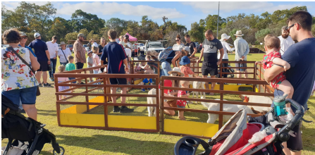
Swan Valley Cuddly Animal Farm

The event started to build just before 4.00pm when the first of our visitors started arriving with curiosity and excitement. By 5.30pm the word had spread far and wide – car parks were full, crowds were milling around the stalls and people were chatting to friends while the kids enjoyed the various activities.