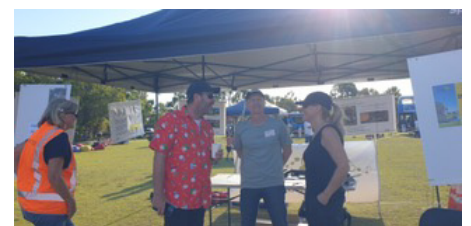
Friends of The Vines Environmental Work

Our event was brought to life by the Ellenbrook Youth Choir who entertained families with their Christmas Carols throughout the afternoon. We would also like to acknowledge 88.5FM our local radio station – who attended for the first time to entertain the crowd with music while they shopped or waited for the littlies by the Gymbus.