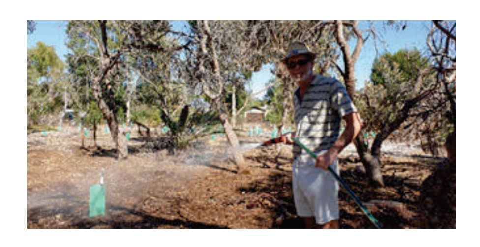
Watering on a Saturday Morning