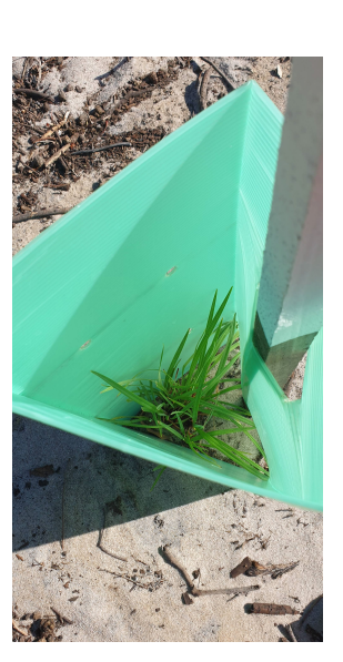
Success - Revival of Plants with better protection and watering

Since the original planting in early 2023 – there have been several attempts – the latest the most successful – to replant natives and regenerate the bush. However, as summer has proven to be rather harsh for plants with little to no water (especially during a heatwave), local residents are working with the VRRA Friends of the Park group to provide a watering service throughout this summer period until the plants are established. There are plans in the future to assist with clearing some of the remaining dead plants to remove any potential for a fire hazard.